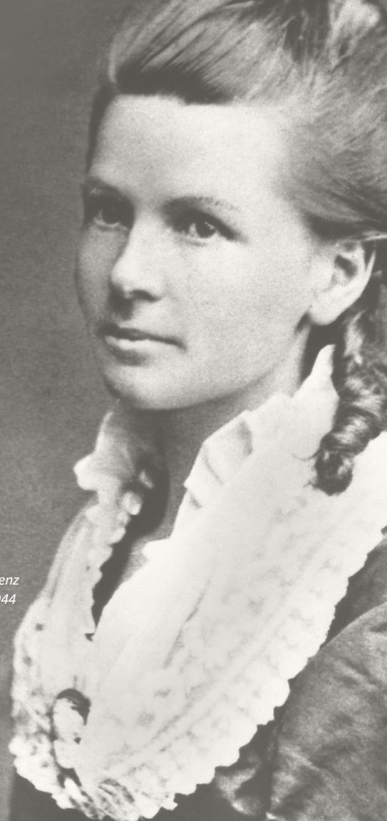
Bertha Benz 1849–1944